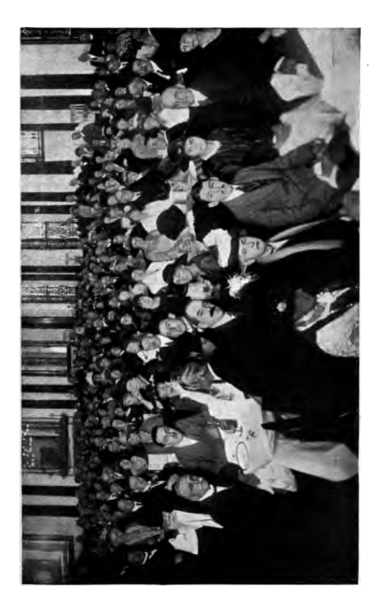
On this occasion 250 out of 290 guests rose as testimony that they were in personal touch with their cladd. THE GOD-SPEED LUNCHEON IN LONDON.